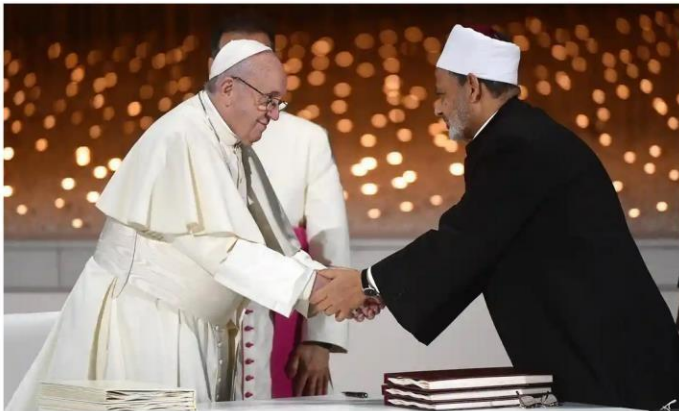
▲ Pope Francis and Sheikh Ahmed al-Tayeb in Abu Dhabi on Monday.

https://www.theguardian.com/world/2019/feb/04/pope-and-grand-imam-sign-historic-pledge-of-fraternity-in-uae