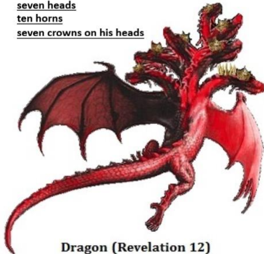
Dragon (Revelation 12)

seven heads ten horns seven crowns on his heads