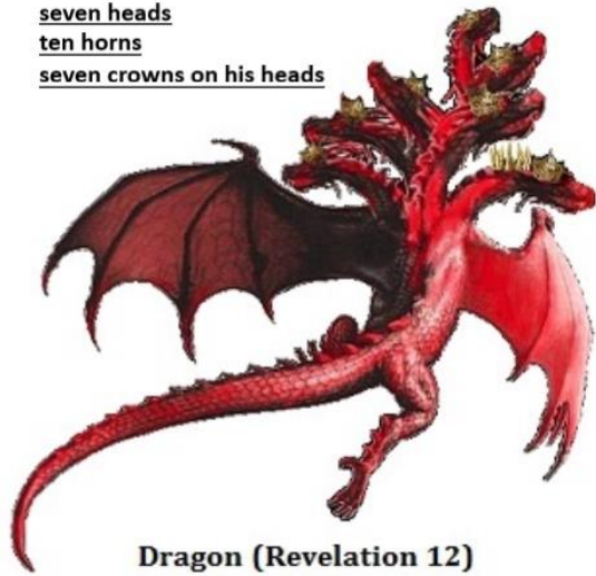
Dragon (Revelation 12)

seven heads ten horns seven crowns on his heads