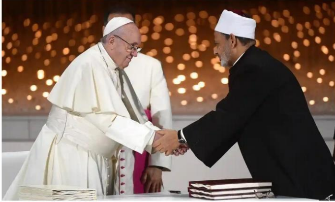
▲ Pope Francis and Sheikh Ahmed al-Tayeb in Abu Dhabi on Monday.

The pope and the grand imam of al-Azhar have signed a historic declaration of fraternity, calling for peace between nations, religions and races, in front of a global audience of religious leaders from Christianity, Islam , Judaism and other faiths.